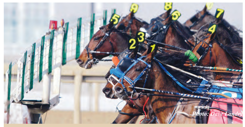
Researchers hope to gain a greater understanding of the link between rhythm disturbances and troponin levels

Measuring troponin levels has been held up as the 'gold standard' in diagnostics for human patients with cardiac disease. Troponin is a protein that is released into the bloodstream and can be detected even when there are only low levels of damage. Physick-Sheard will be the first to tell you, "Horses don't have heart attacks," but coming up with a standard troponin test for horses may allow vets to detect heart muscle impacts before they can become a cause of poor performance or mortality.